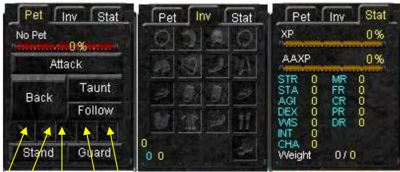
Slot 1 Slot 2 Slot 3 Slot 4 Slot 5